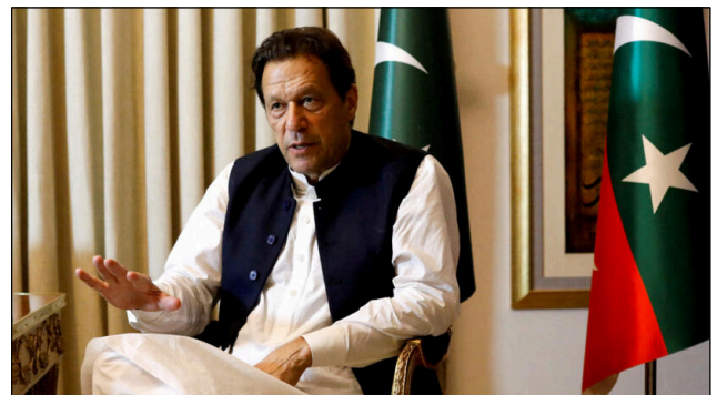
Imran Khan (Picture ma)

The note by the Pakistani diplomat was sent back home and Imran Khan was voted out of