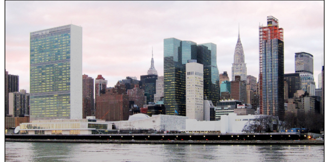
View from Roosevelt Island to the UN headquarters in New York.

The joint US-Israeli attacks were described by Trump as necessary because Iran “rejected every opportunity to renounce their nuclear ambitions, and we can’t take it anymore”. This is of course a flat lie. As the letter of 16 February recounted, Iran agreed a decade ago to a nuclear deal, the Joint Comprehensive Plan of Action 2 (JCPOA) that was adopted by the UN Security Council in Resolution 2231. It was Trump who ripped up the agreement in 2018. In June 2025, Israel bombed Iran in the midst of US-Iran negotiations. This time too, the Israel-US war plans were set weeks ago when Netanyahu met with Trump, and the negotiations underway between the US and Iran were a charade. This seems to be the new modus operandi of the US: start negotiations and then aim to murder the counterparts.