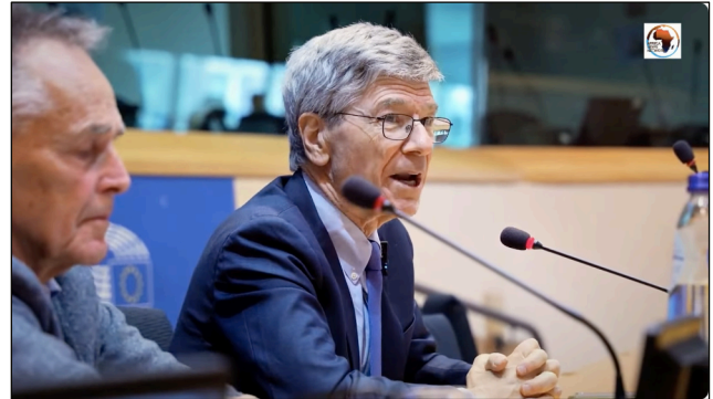
Jeffrey D. Sachs addressing the EU Parliament on 19 February 2025.

I've watched the events very close-up in Eastern Europe, the former Soviet Union, Russia and Ukraine, very closely for the last 36 years. I was an adviser to the Polish government in 1989, to President Gorbachev's economic team in 1990